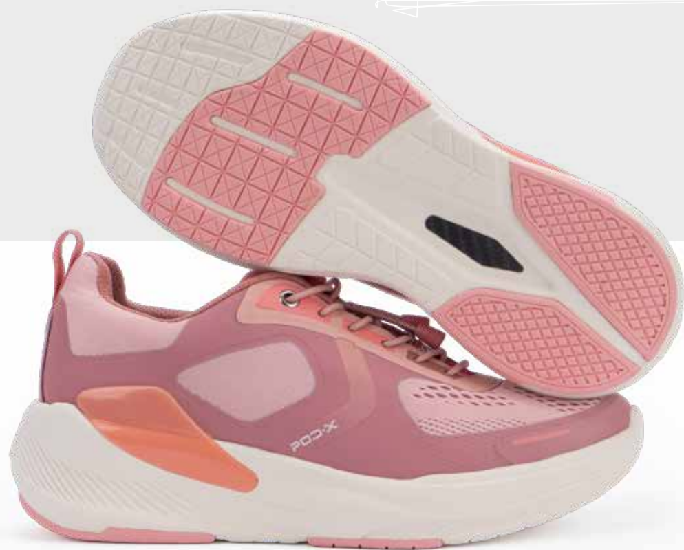
Stabilising and extended backcounters.