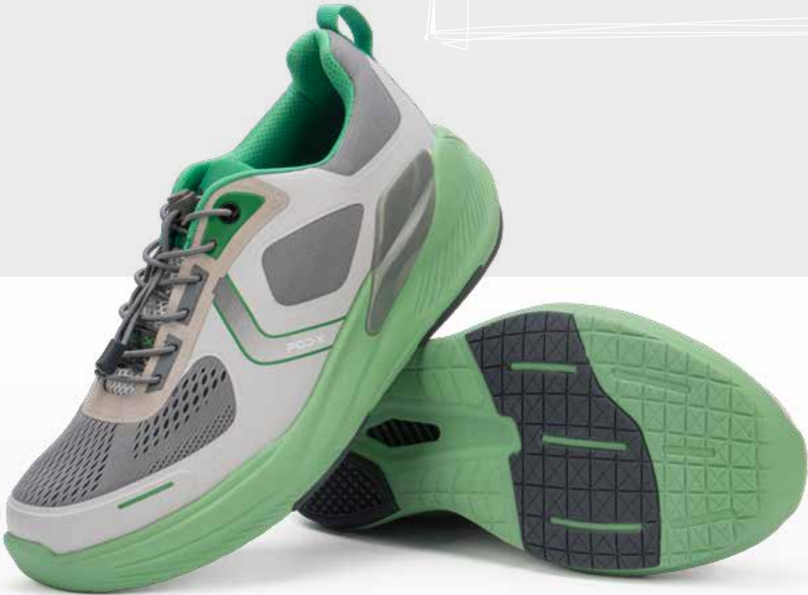
Stabilising and extended backcounters.